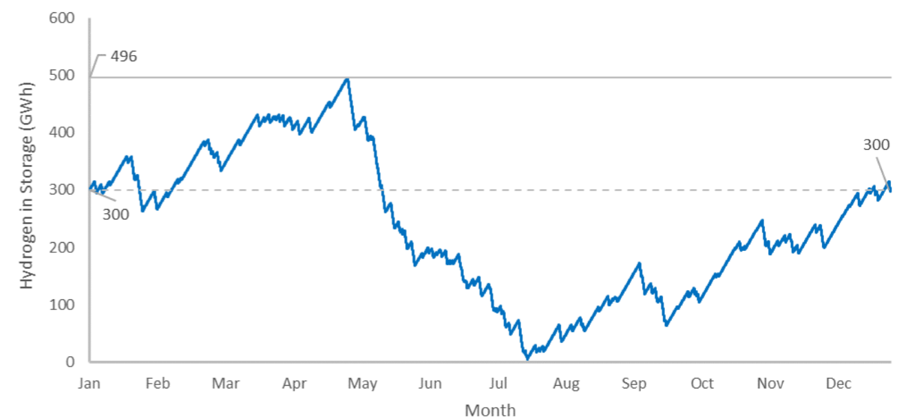
Hydrogen in Storage for Hydrogen Fired Power Generation at Times of Low Offshore Wind Generation